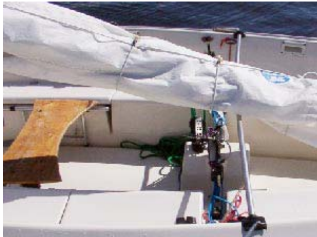
ISR - Main trimmer's bar showing clamp on far side. Forward seat with lock braces into seat locker drains