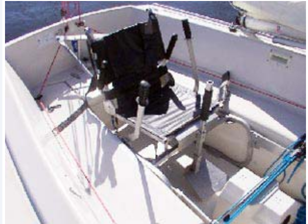
USA – skipper seat with lever tiller system