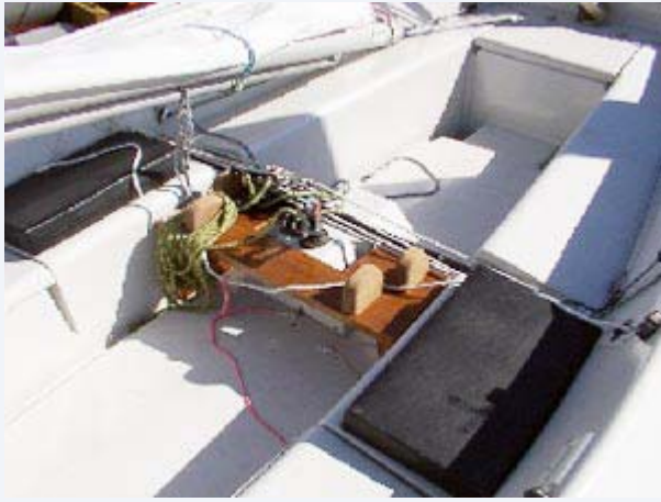
GER – Drop-in foot rest for main trimmer