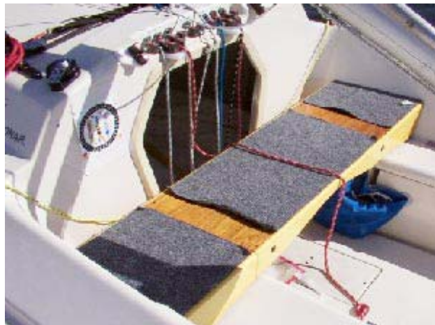
CAN – Forward seat