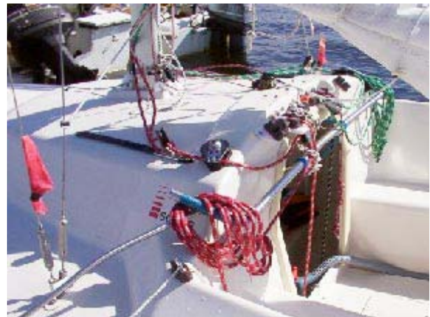
ISR - Jib man handles and bar.