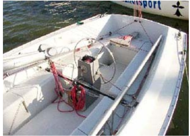
GBR - Wheel steering