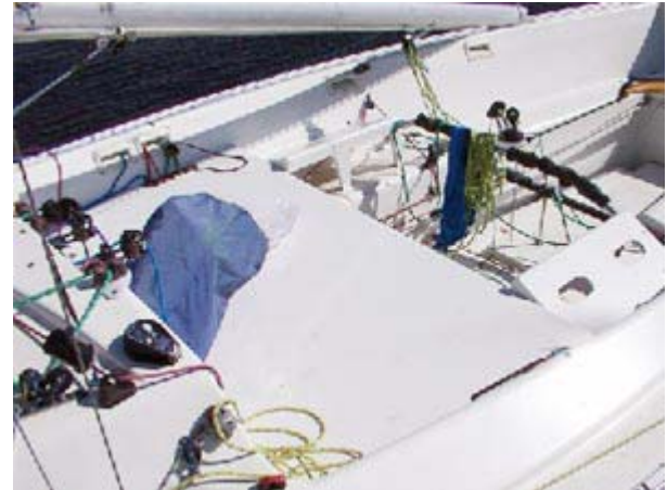
CAN – Another angle of seats