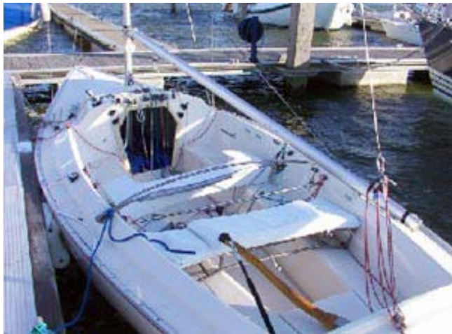
USA - crew transfer seat, bars, helmsman seat