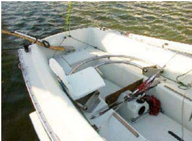
DEN - Helmsman sliding seat