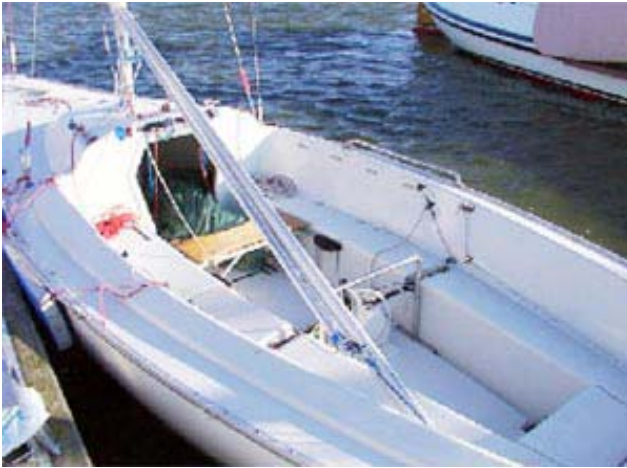
ISR - Simple forward seat/bench, helmsman loop, handles on rail