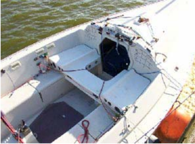
NED - Crew seat with controls run to back