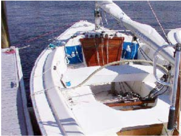
SWE – Tiller and seats