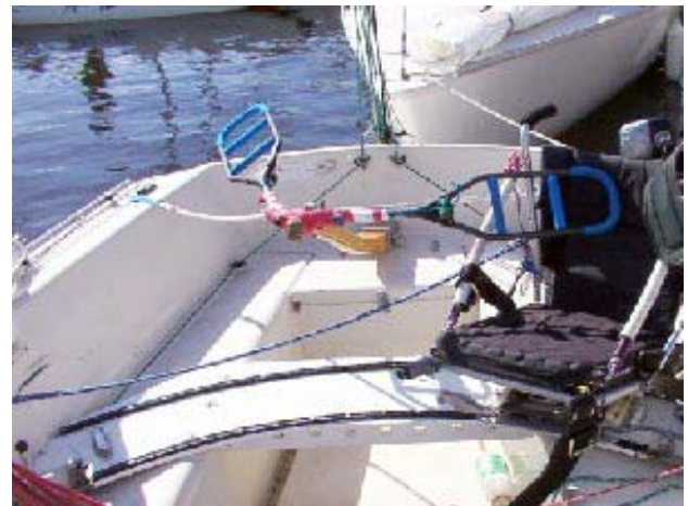
USA – Tiller system and translating seat.