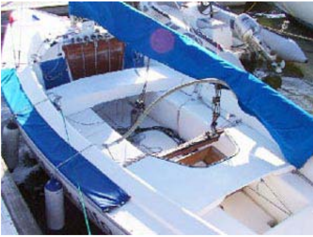
SWE - Large helmsman loop, transfer seats