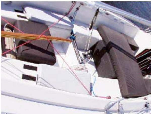
IRL – Drop-in and velcroed cushions