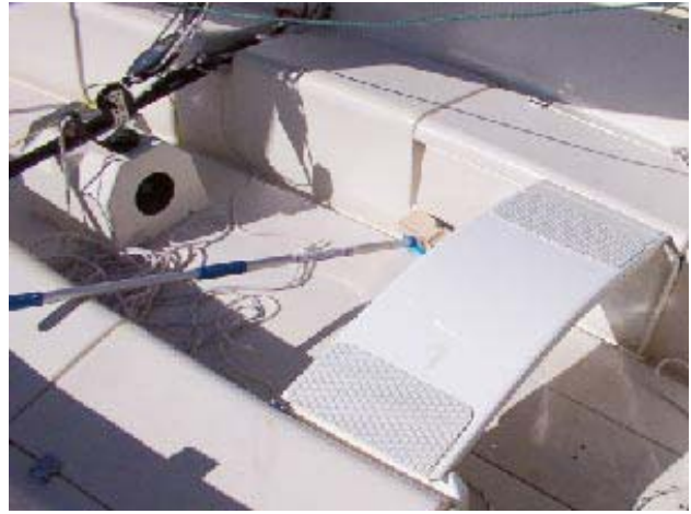
GBR – Forward transfer seat, angled and non-slip