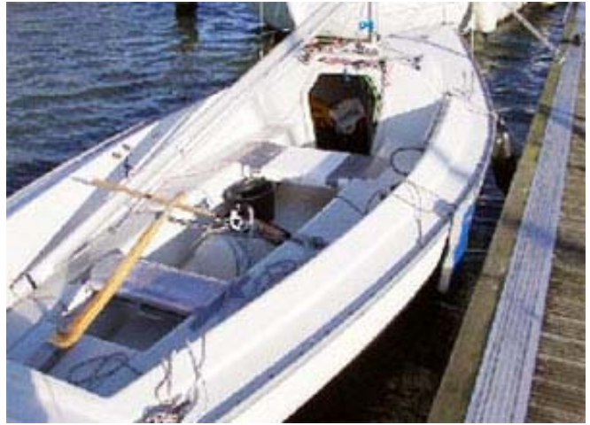
NED - Simple seats/benches