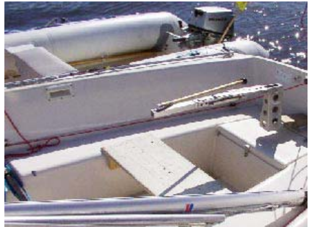
CAN - tiller which folds up or down as needed