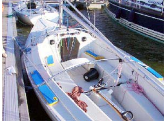
GBR - Transfer seat forward, deck pads, helmsman loop