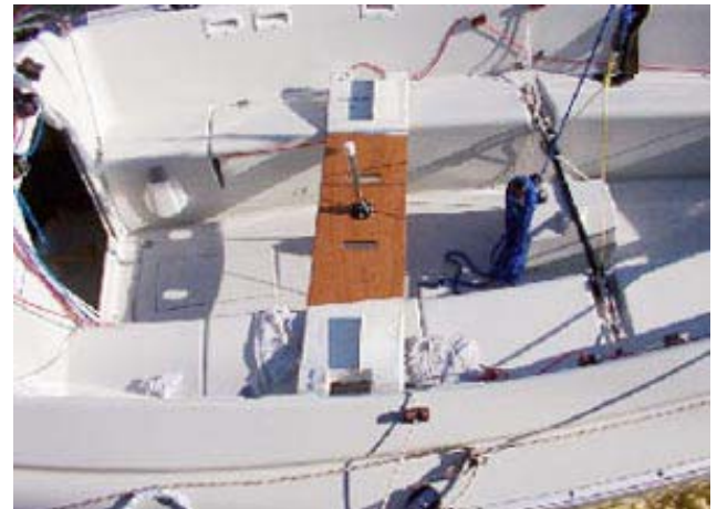
JPN - Simple crew seat with middle support and metal pieces to drop into seat locker gap